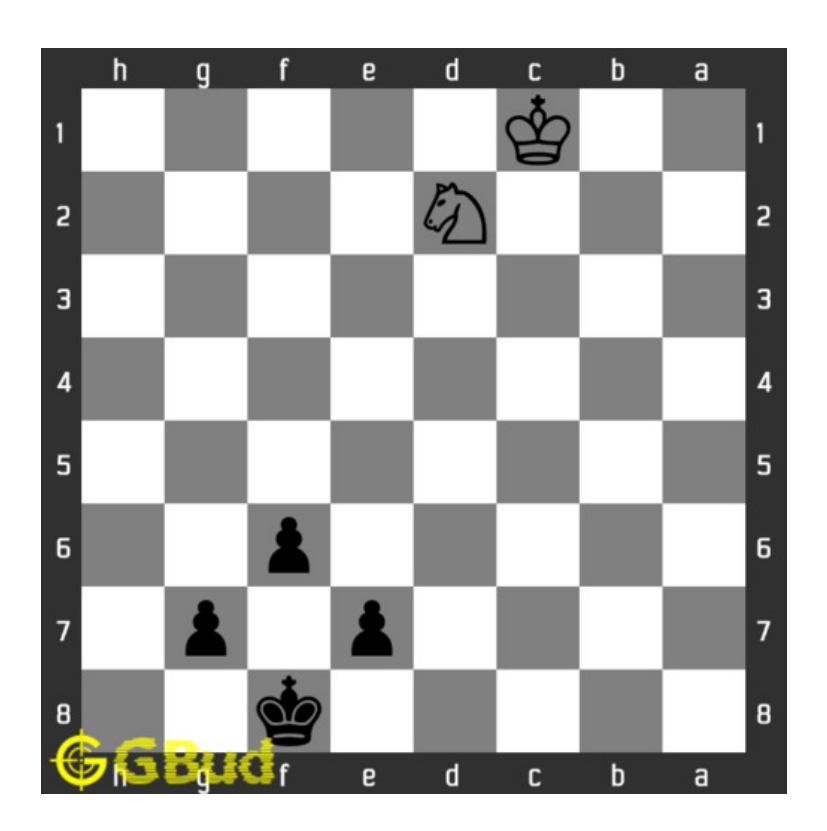
Figure 1.1: Solve this easy chess puzzle 0014. Move the pawn in f file @ https://gbud.in/g49qp41